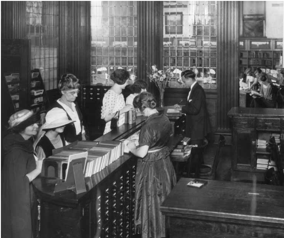
An undated view of the Blackstone Library's interior