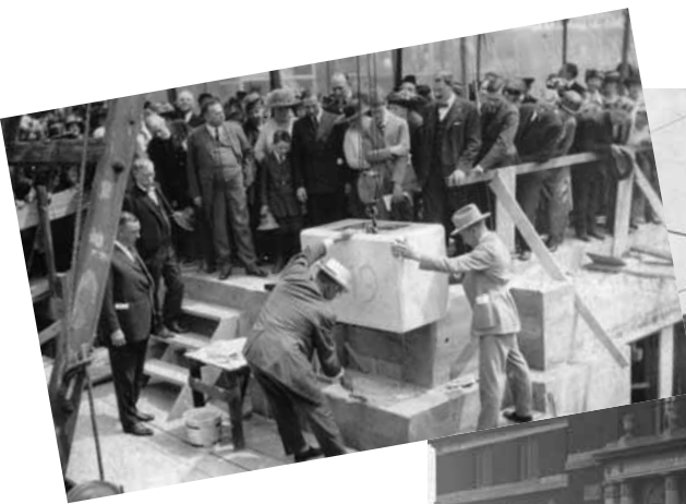
Above: Laying the cornerstone of the Legler Regional Branch at Crawford and Monroe in 1919. Participants included the mayor and board president. Right: The finished library in 1924