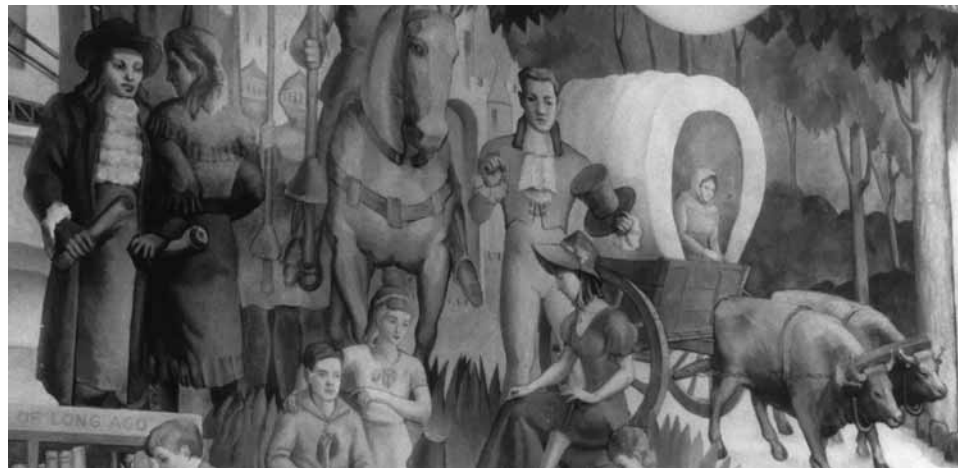
The handsome murals of the Hild Regional Branch have been retained in its new life as the Old Town School of Folk Music